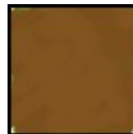
Goal mouth brown