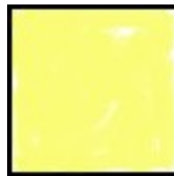
Bedroom carpet yellow